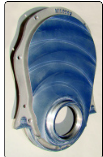
Big Block Chevy Gen VI Unpolished - #14875