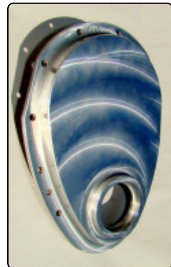
Small Block Chevy Billet Style - #14801