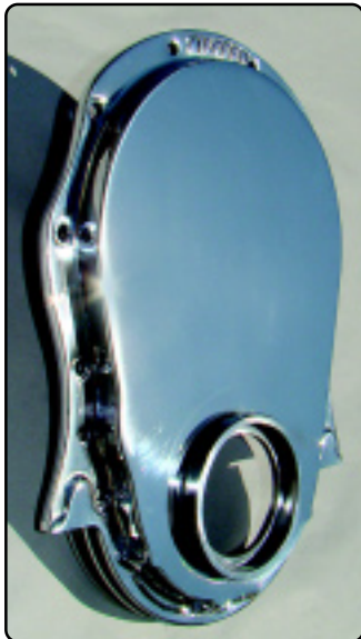
Big Block Chevy Mark V Polished - #14860