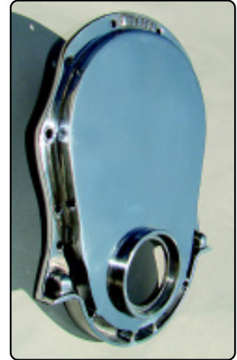
Big Block Chevy Mark IV Polished - #14850