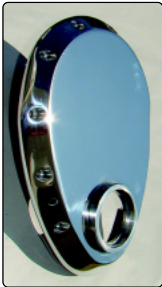
Small Block Chevy Polished - #14800